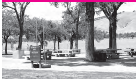
CENTRAL PARK PICNIC RESERVATIONS