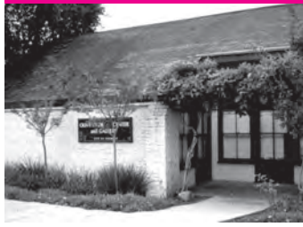
OLIVE HYDE ART CENTER