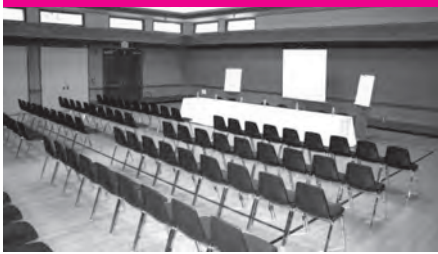
CENTERVILLE COMMUNITY CENTER