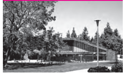
WARM SPRINGS COMMUNITY CENTER