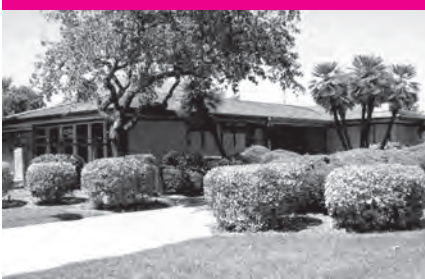
LOS CERRITOS COMMUNITY CENTER